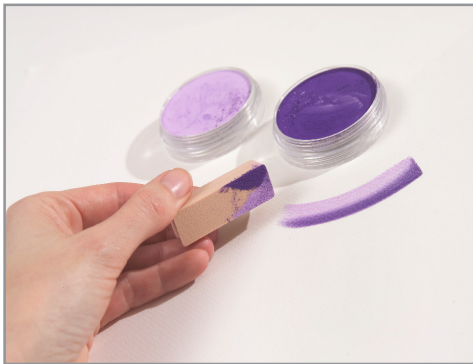
5. Double load Sofft™ Tool with two colors and apply. Lift 1 st color on one side, then 2 nd color on the other side of the same tool. Tip: Load the palest color first.