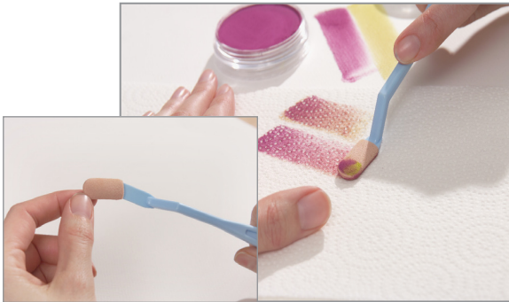
3. "Clean" Sofft tools between colors by wiping on a dry paper towel to remove color from the surface of the sponge. The same tool can then be used with several colors. Tip: Wipe KNIFE/COVER side to side so the paper towel doesn't drag the cover off.