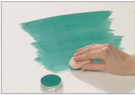
1. Apply a large area of color using a large sponge (Big Oval or Angle Slice) – it's so much easier to do this with PanPastel compared to pastel sticks for backgrounds / underpaintings / "dry washes" and very little dust is generated.