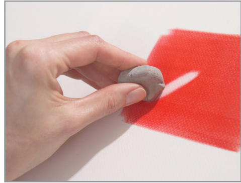
6. Erase color(s) with any eraser