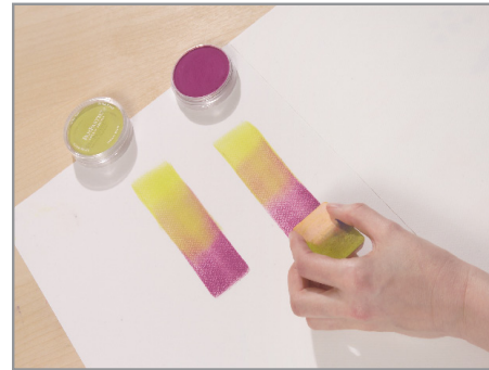
4. Mix colors - like paint - to create intermediate colors. (Traditional painting/color mixing rules apply.) Tip: If a pan's surface becomes contaminated with another color, "clean" pan by gently wiping away the contamination with a clean sponge or paper towel.